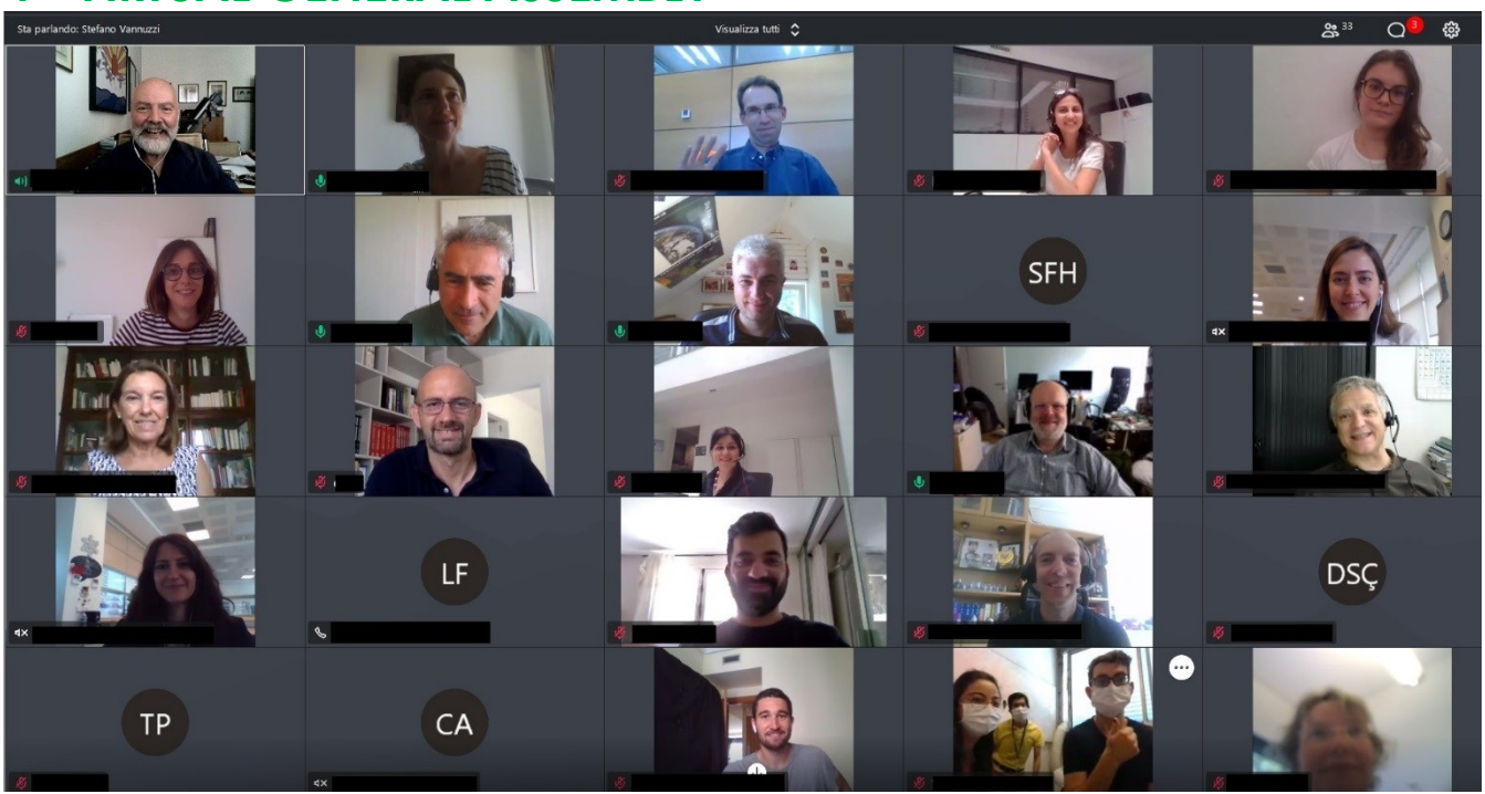
The 4<sup>th</sup> BiZeolCat General Assembly took place Online to assess the project's achievements at Month 18!

The main objectives of the meeting were the assessment of the project's achievements (milestones and deliverables) and the development of the plan for the next steps. The meeting was very intensive and all the participants collaborate actively providing a friendly atmosphere and strengthening the relationships among the partners even remotely connected. All the topics in Agenda were successfully addressed!